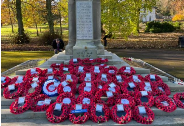
Remembrance Parade and Service – 10 th November, 2024 Cenotaph, Bedwellty Park ( support role only )

Christmas Light switch-on – 29 th November, 2024